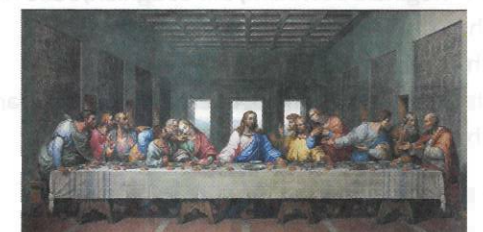
The Last Supper by Leonardo da Vinci in the Convent of Santa Maria delle Grazie

When Luke talks about "disciples", he does not mean simply "the twelve apostles". When we listen to the Gospel, we might keep this wider meaning in mind – and include ourselves among the disciples. ■