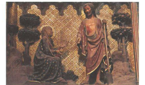
Christ and Mary Magdalene – relief from Notre-Dame cathedral in Paris

Easter is our opportunity to renew our faith and our commitment to Jesus and the teachings of the Gospel.