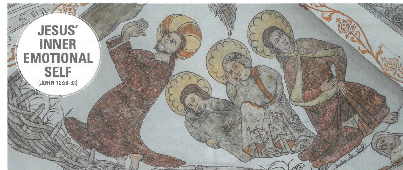
“Agony in the Garden”, a wall-painting from about the year 1500, in the Church of St Mary, Elsinore, Denmark

When he is told that “some Greeks”, who have come to Jerusalem for the festival of Passover, want to see him, Jesus tells his disciples that “the hour” for him to be glorified has arrived. The period of his revealing his glory, which began with the first sign at Cana and ended with the final one of the raising of Lazarus, is over, and his passion is about to begin.