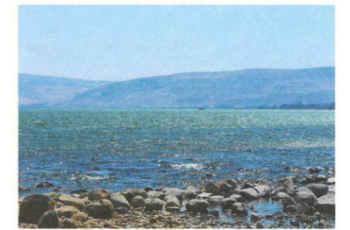
View of the Sea of Galilee from the shore

Disciples normally chose to follow the rabbi whose teachings and way of life impressed them: Jesus is unusual in selecting his disciples.