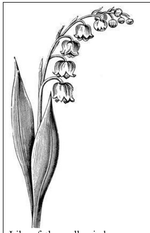
Lily-of-the-valley is known as Our Lady's Tears , because it is said to have grown where she wept