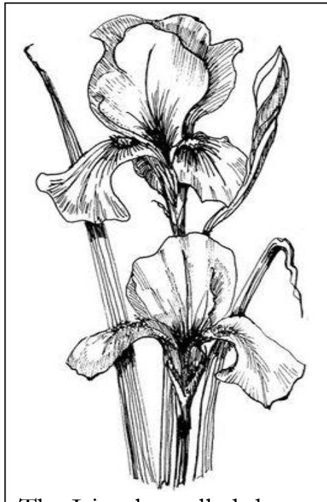
The Iris, also called the Fleur de Lis or sword lily symbolizes Mary's sorrow and the sword that pierces her heart